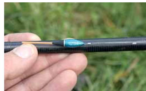
FLOAT: A Chianti is best in the calmer water