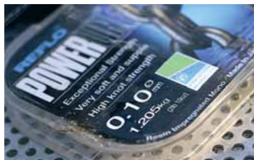
LINE: there's no need to drop below 0.10mm

bottom bait is my preference. Two swims one at 3 metres to start with and one at 8 metres for later on should be sufficient. Change to the 8 metre swim when you can see the odd bubble appear and expect the bigger skimmers and bream to respond..'