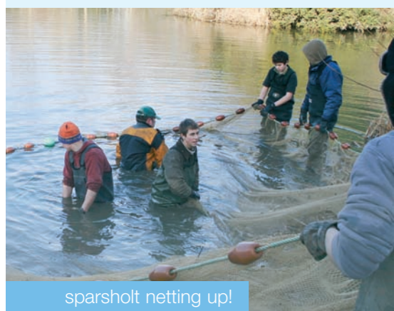
sparsholt netting up!

really cracked on with the tasks and did a great job. The lakes they concentrated on this year were the two specimen lakes Pats Pool and Nelsons. Pats pool produced an amazing 1000lb plus of silver fish, which were moved into Python, they also recorded over 275 carp between 12lb to 25lb. The biggest surprise was that they recorded over 100 catfish, with two of the fish bottoming the scales at over 55lb! This was a great result as the original stocking was made over 10 years ago with only 11 catfish stocked in Pats pool at only 1lb each. Nelsons produced a massive amount of fish, approximately 500lb of quality Roach some of which were well over the 1lb mark, they were moved to some of our other pleasure lakes and about 50 Carp between 15lb to 28lb. The college assists White Acres each year in the movement of fish from lake to lake in the never-ending quest, keeping the fishing to the highest level. All in all they did a great job and it was so pleasing to see so many enthusiastic youngsters taking an interest in the business!