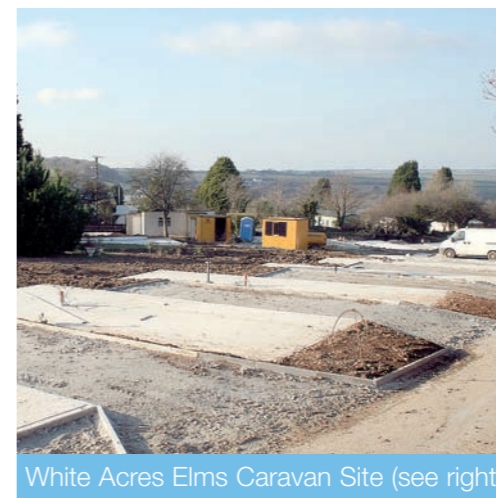
White Acres Elms Caravan Site (see right)