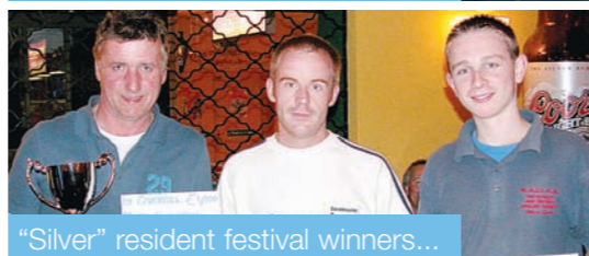
"Silver" resident festival winners...