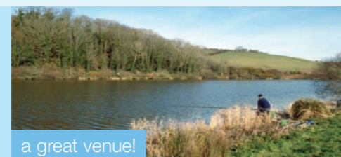
a great venue!